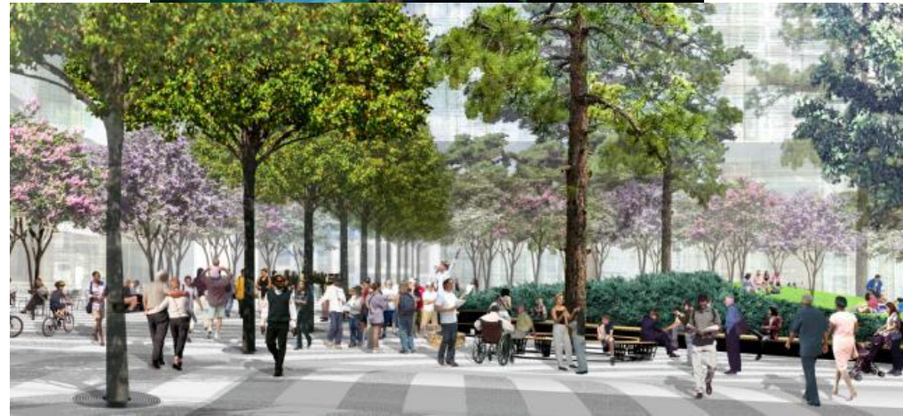
Illustrative Open Space Design