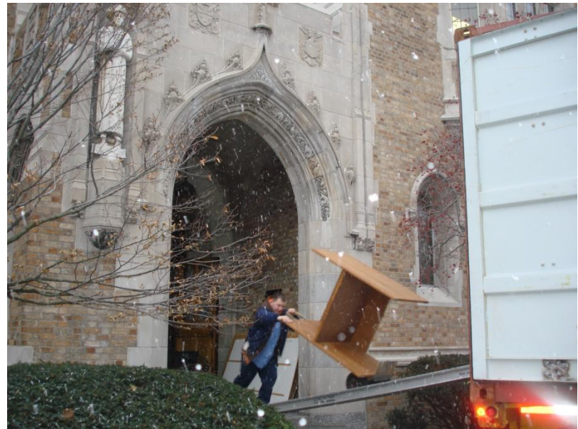
Loading for shipment to Haiti